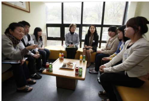
Mary Robinson with young women refugees from the DPRK at the Yeomyung School in Seoul