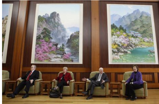
The Elders at the state guesthouse in Pyongyang