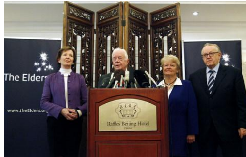
Mary Robinson, Jimmy Carter, Gro Brundtland and Martti Ahtisaari at the Elders' press briefing in Beijing

“Food is a basic human right, but because of serious weather problems and donor cutbacks, the amount of food being distributed to families is well below what is needed, leading to a hidden crisis. Food aid levels must be raised significantly and urgently. Donors should be reassured by the DPRK’s recent agreement with the World Food Program to improve transparency and monitoring of food distribution.” (Mary Robinson)