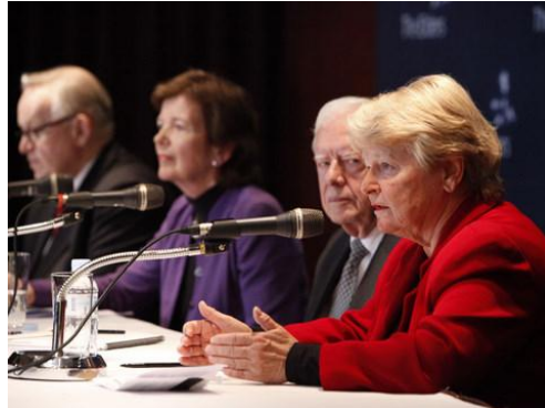
Martti Ahtisaari, Mary Robinson, Jimmy Carter and Gro Brundtland at The Elders' press conference in Seoul