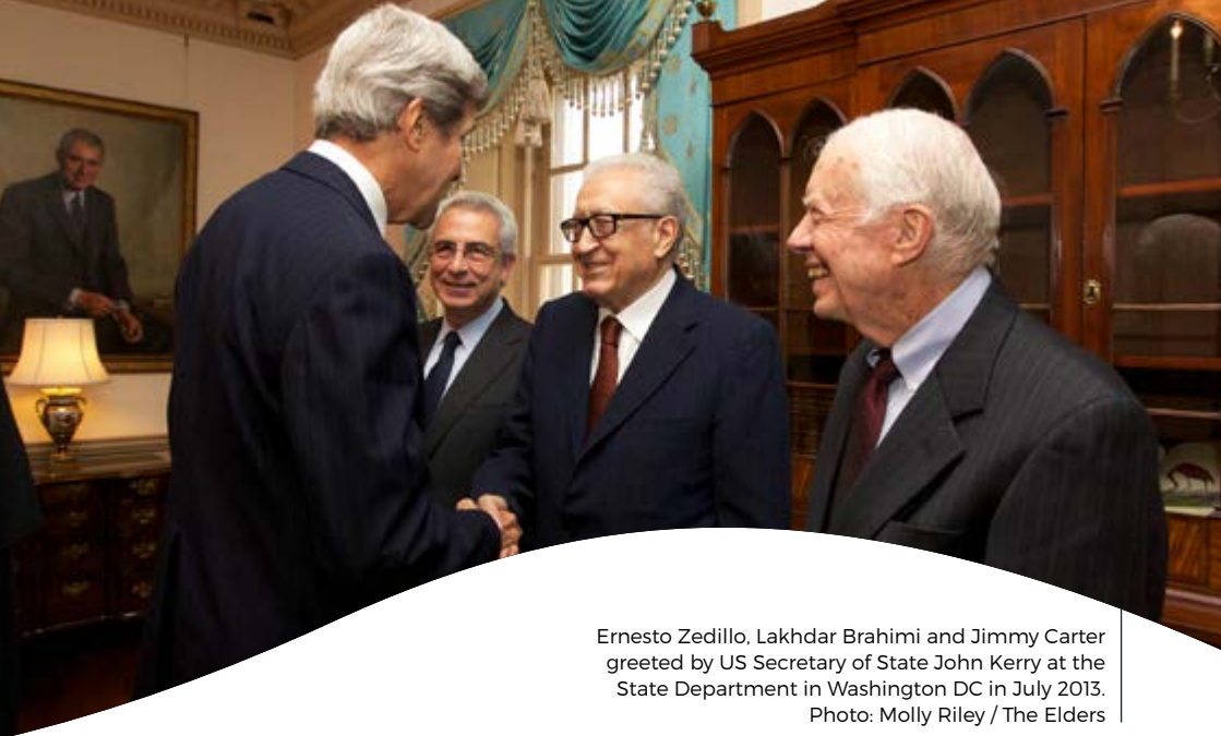
Ernesto Zedillo, Lakhdar Brahimi and Jimmy Carter greeted by US Secretary of State John Kerry at the State Department in Washington DC in July 2013.

But in a world serious about moving to nuclear disarmament it ought to be possible for the great majority of nuclear weapons to be not only moth-balled, but at least partially dismantled as well.