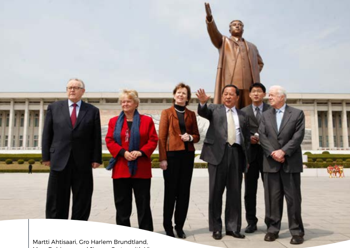
Martti Ahtisaari, Gro Harlem Brundtland, Mary Robinson and Jimmy Carter with Vice Minister of Foreign Affairs of North Korea, Ri Yong Ho during a visit to North Korea in April 2011.