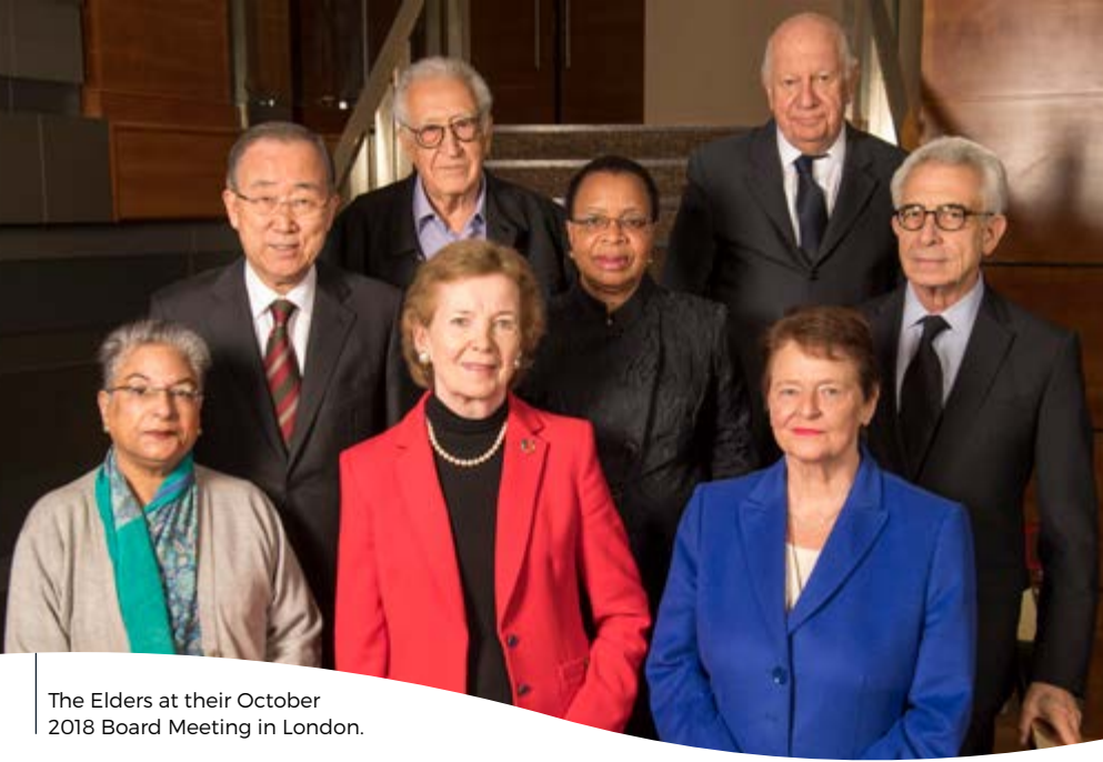
The Elders at their October 2018 Board Meeting in London.