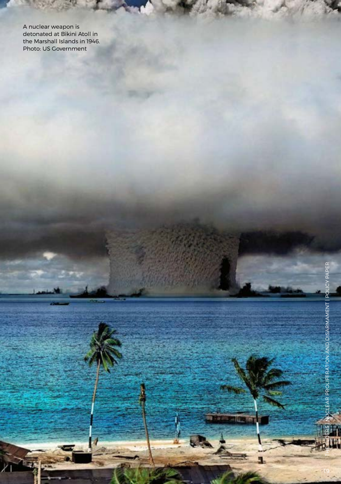
A nuclear weapon is detonated at Bikini Atoll in the Marshall Islands in 1946.