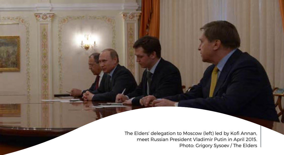
The Elders' delegation to Moscow (left) led by Kofi Annan, meet Russian President Vladimir Putin in April 2015.