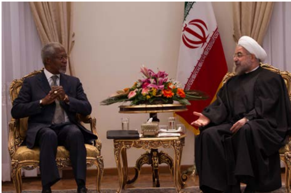
Kofi Annan meets Iranian President Rouhani during an Elders visit to the country in January 2014.