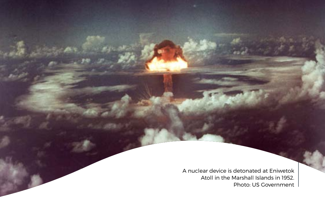
A nuclear device is detonated at Eniwetok Atoll in the Marshall Islands in 1952.

Given this dismal record, the fact that the world has survived for over seven decades without a nuclear weapons catastrophe is not a matter of inherent system stability or great statesmanship. It has been just sheer luck.